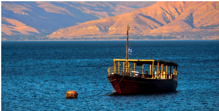
Sea of Galilee ~ Tiberias

Drive north today to Caesarea to view the ruins of the Crusader's fortress and moat and sit in the great Roman amphitheater. Continuing along the coast, you will see the aqueduct that carried water from Mt. Carmel to Caesarea. Continue to Haifa where you will ascend Mt. Carmel for a magnificent view of the sea and harbor. See the Carmelite Monastery and Elijah's Cave. Proceed to Nazareth, the boyhood home of Jesus. Here you will visit the Church of the Annunciation and the winding streets of the old city. Next, ascend Mt. Tabor and visit the church of the Transfiguration. Proceed to Tiberias for the night. (B,D)