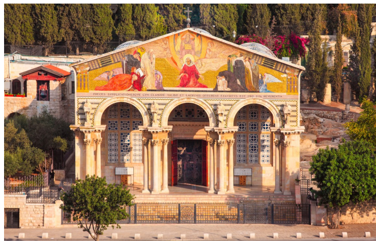
Church of All Nations