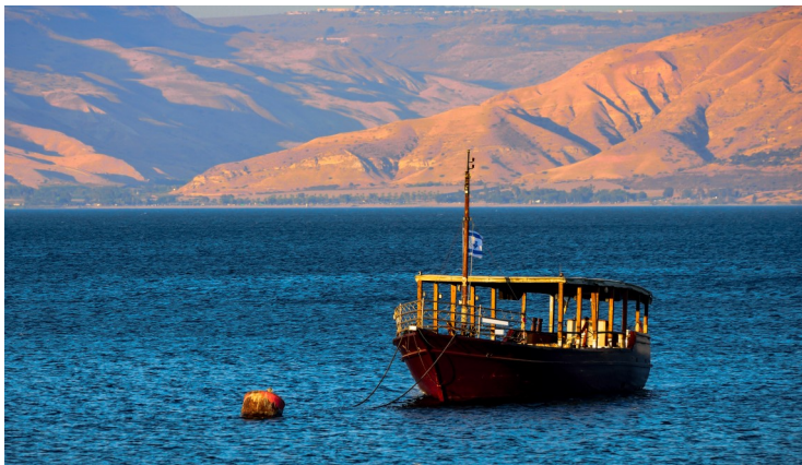
Sea of Galilee ~ Tiberias

Drive north today to Caesarea to view the ruins of the Crusader's fortress and moat and sit in the great Roman amphitheater. Continuing along the coast, you will see the aqueduct that carried water from Mt. Carmel to Caesarea. Continue to Haifa where you will ascend Mt. Carmel for a magnificent view of the sea and harbor. See the Carmelite Monastery and Elijah's Cave. Proceed to Nazareth, the boyhood home of Jesus. Here you will visit the Church of the Annunciation and the winding streets of the old city. Next, ascend Mt. Tabor and visit the church of the Transfiguration. Proceed to Tiberias for the night. (B,D)