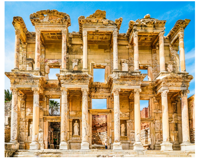
Library of Celsus ~ Ephesus

Early this morning, transfer to the Istanbul airport for a flight to Izmir. Meet your guide and motor-coach upon arrival for your transfer to Ephesus, one of the Seven Wonders of the Ancient World and the First Church of Revelation. Ephesus was the capital of Roman Asia Minor and Paul preached and taught here for over two years. View the magnificent harbor and the great amphitheatre which seated nearly 25,000 people. See Marble Street, the Library of Celsius, a gymnasium and the Tem-