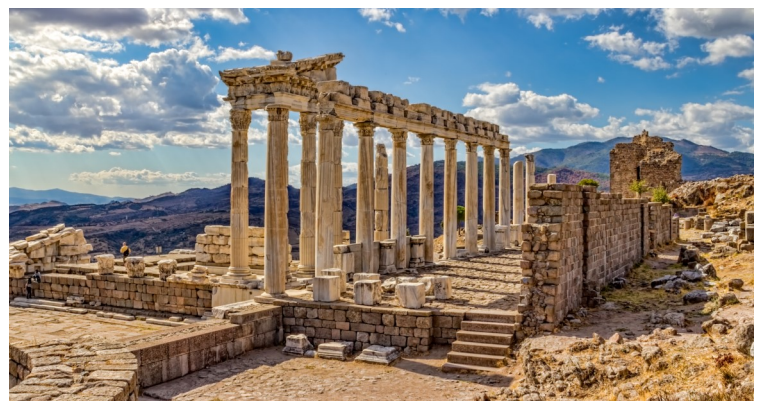
Temple of Trajan ~ Pergamum

and visit another of the Seven Churches of Revelation. Here, view the ancient ruins of the famous temples dedicated to the healing gods of Asklepios and Serapis, along with the Acropolis, the Temple of Athena, and the Trajan Temple. This city was considered diabolical by early Christians because of the many pagan temples located here. Travel to Canakkale for the night. (B,D)